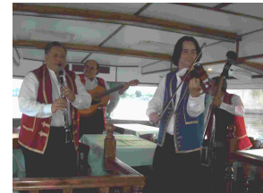
Traditional Gipsy Band

cruise on the Danube, a dinner and typical English hospitality.