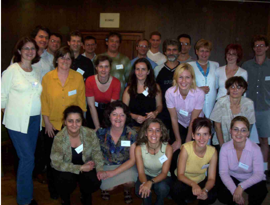
Those who attended the EGIS English club on the 18 th September 2003

enthusiastic group of ESU members. They have meetings twice a month. If you are interested in helping or would like to set up a similar club at your place of work contact us on the address given in this Newsletter.