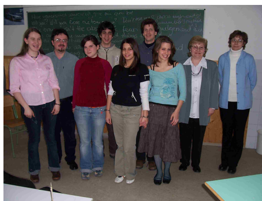
Budapest Local Area Final, judges and winners

We wish all competitors the best of luck for the finals and don't forget to e-mail your list. If in doubt send your name even if you later find you cannot come.